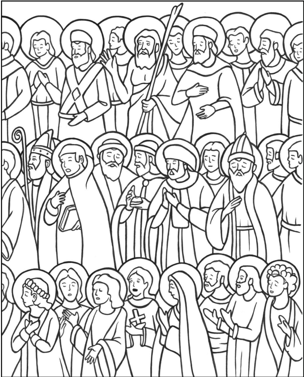
All Saints Day (November 1st) - © 2016 TheCatholicKid.com All rights reserved.